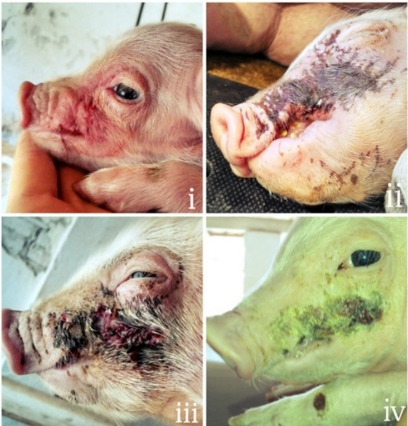
Figure 1. Mismanagement by the teeth wear equipment and absence of lesions from disputes among piglets (Manejo inadecuado por el equipo de desgaste de los dientes y ausencia de lesiones de disputas entre lechones).

The analysis of the temperature of the piglets was performed through the fixed period effect, treatment and week with means compared by Fischer Means the test t Student. As for performance, an analysis of