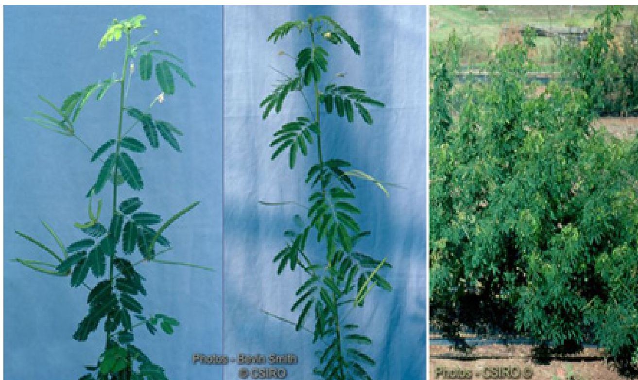
Figure 1. Desmanthus pernambucanus (L.) Thellung (jureminha) [(Cook et al. 2005)] ( Desmanthus pernambucanus (L.) Thellung (jureminha) [(Cook et al. 2005)]).